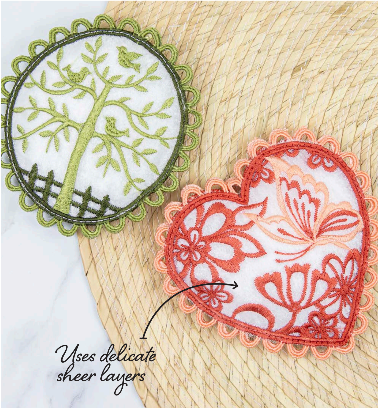
Uses delicate sheer layers

Take a trip to the spa all while never leaving the comfort of your own home with these adorable bath time sachets! Fill them with scented bath salts to create a sachet to throw in the bath and relax and calm your nerves.